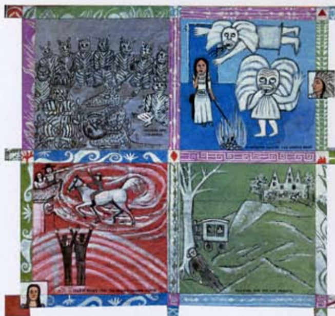
detail: Faith Ringgold, Crown Heights Children's History Quilt , 1996 P.S. 22, Brooklyn